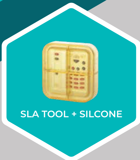
SLA TOOL + SILCONE