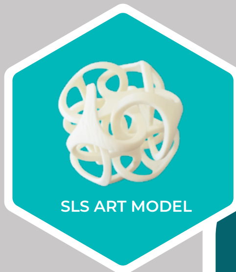
SLS ART MODEL